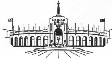
SITE OF 1932 AND 1984 OLYMPICS ATHLETICS COMPETITION OPENING & CLOSING CEREMONIES